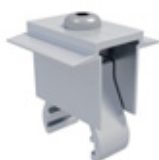
Roof hook Alu 100-7-45 complete Art. No. 30-600-013