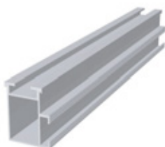
Splice 7 SP Art. No. 30-200-015